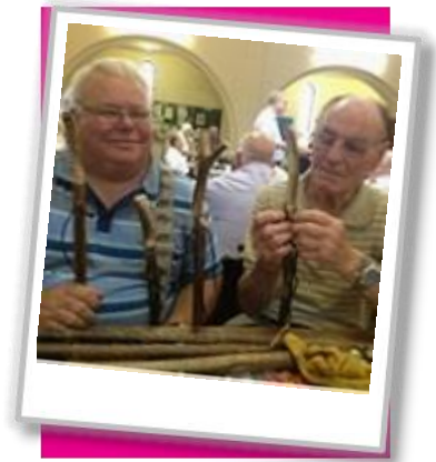
Members of the Men in Sheds project