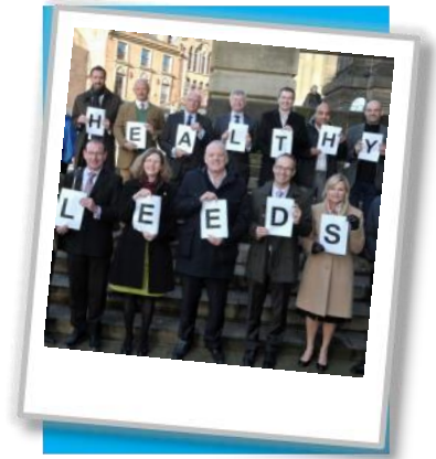
The Leeds Health and Wellbeing Board

The Leeds Health and Wellbeing Board oversees how we improve the health and wellbeing of the people of Leeds. The Joint Health and Wellbeing Strategy (JHWS) is vital to how we will work together to make it all happen. The Board is updating the JHWS and there will be a public consultation, with a new strategy being adopted in March 2016. Our aim is that Leeds will be a healthy and caring city for all ages, where people who are the poorest, improve their health the fastest. The proposed five outcomes for the Health and Wellbeing Strategy 2016-2021 are: